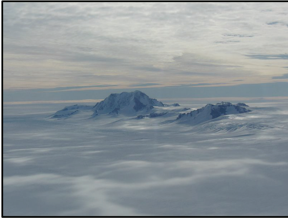
Image source: NASA Goddard Space Flight Center from Greenbelt, MD, USA - Antarctic mountains

TRUE OR FALSE: THE SAHARA IS THE LARGEST DESERT ON EARTH.